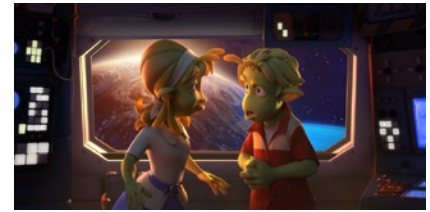
Planet 51 , the movie & the characters of Planet 51 ©2009 Ilion Animation Studios/HandMade Films International/A3 Films/Lem Films & Chuck & Lem SL. All Rights Reserved.

Designed by professional artists, Mudbox software gives 3D modelers and texture artists the freedom to realize their vision without worrying about technical details. A leading digital sculpting and texture painting solution, Mudbox combines a highly intuitive user interface with a powerful creative toolset for creating ultra-realistic 3D models. Breaking the mold of traditional 3D modeling applications, Mudbox delivers an organic brush-based 3D modeling experience that includes 2D and 3D layers to more easily manage sculpting and painting iterations on multiple meshes and maps. Artists and modelers can also evaluate or present their work in an on-target environment, helping provide accurate, realistic results.