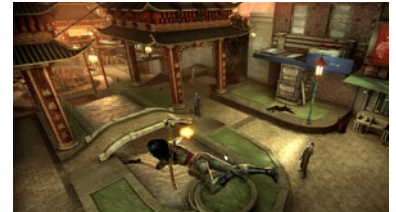
WET™ © 2009 Artificial Mind and Movement Inc. Image courtesy of Artificial Mind and Movement Inc. All rights reserved.