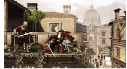
Assassin's Creed II .

* Savings based on USD SRP. International pricing may vary.